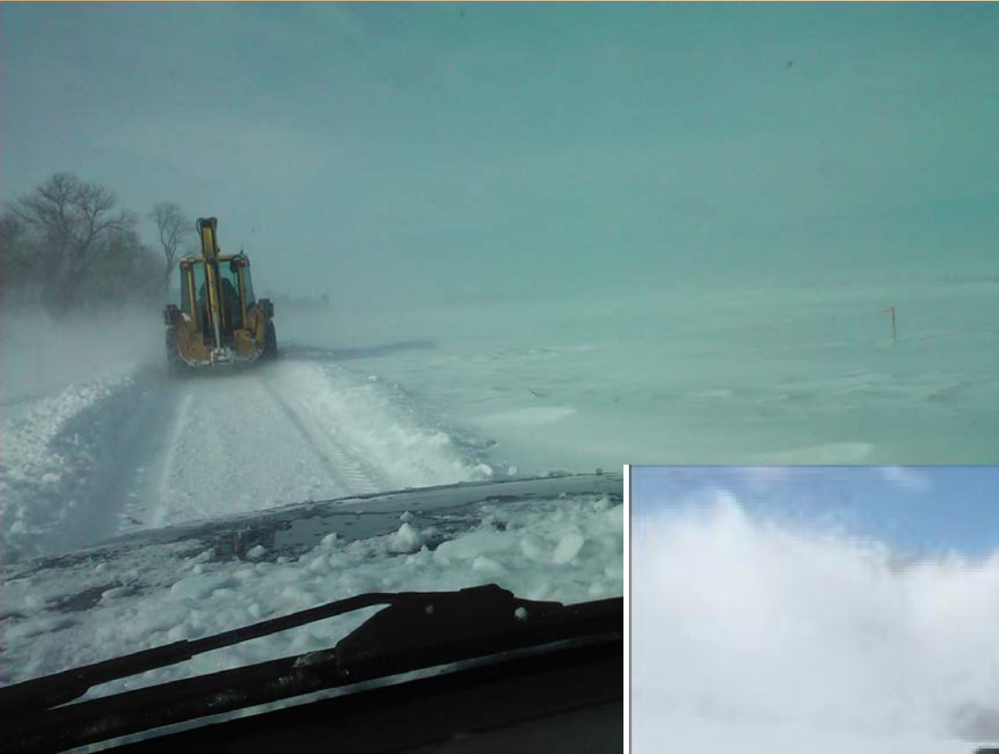
Route 72 near Hampshire